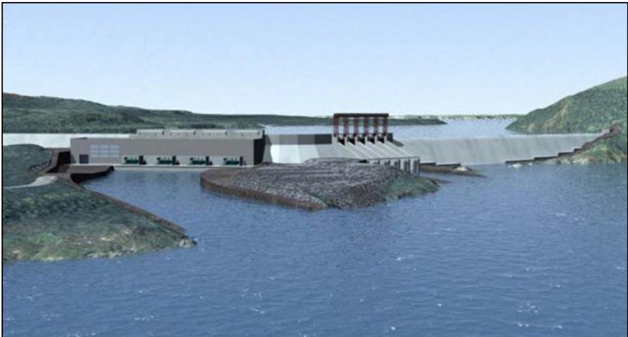
Figure 6-1 Muskrat Falls Generating Facility