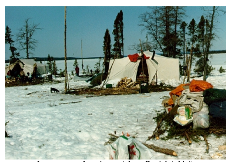
Innu camp at Iatuekupau