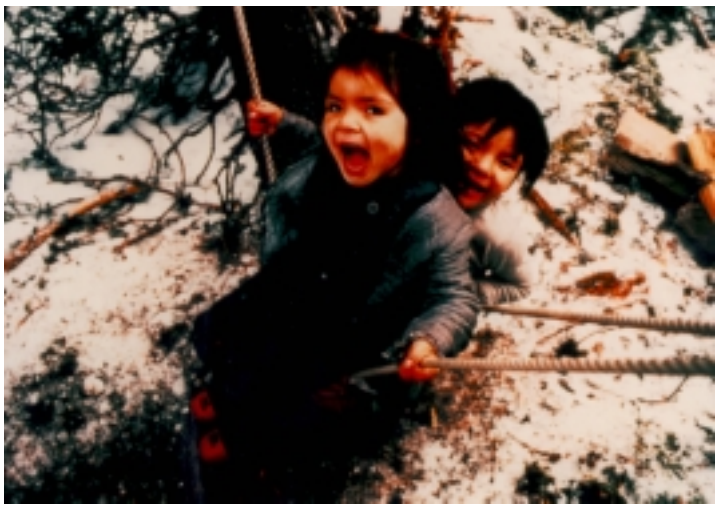
Innu children playing at Enakapeshakamau