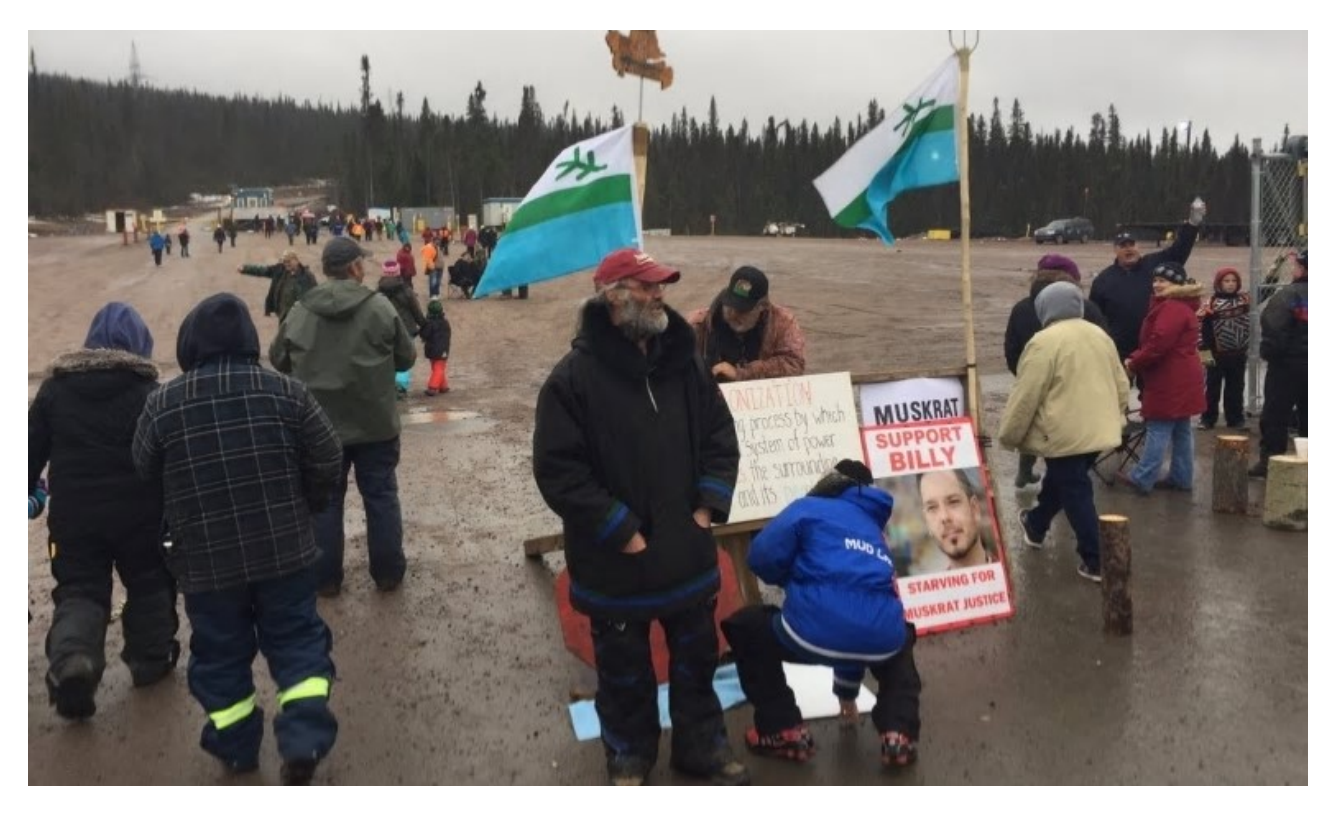
Protesters enter the Muskrat Falls site after breaking through a gate Saturday afternoon.

Muskrat Falls workers bused out after protesters occupy site in Central Labrador | CBC N... Page 4 of 8 CIMFP Exhibit P-01688 Page 4