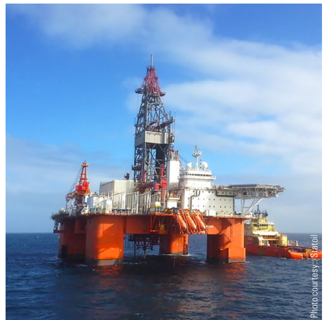
The semi-submersible West Aquarius is used for exploration, appraisal and development drilling in the province's offshore region.

Since 2007, the Provincial Government has entered into benefits agreements for the South White Rose Expansion Project (Husky Energy), the Hibernia South development (Hibernia Management and Development Company), the Hebron development (ExxonMobil Canada), and the West White Rose Expansion Wellhead Platform project (Husky Energy). These benefits agreements target maximum sustainable supply and service industries and employment where we have the potential to create or capitalize on our competitive advantages. The agreements include commitments related to employment, contracting and procurement, gender equity and diversity, and prescribe work to be done in the province related to engineering, construction and fabrication. In negotiating and monitoring these agreements, the Provincial Government works with various stakeholders and partners including project operators, unions, the C-NLOPB, NOIA and the local service and supply community.