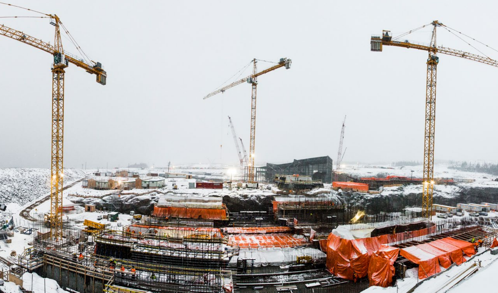
Construction of the Muskrat Falls hydroelectric generating facility in Labrador. Now in the third year of construction, the project is generating significant employment and business benefits for Newfoundland and Labrador.